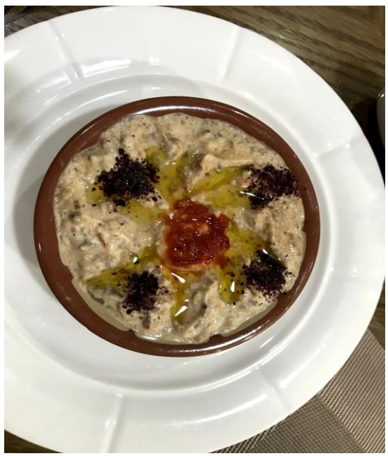
Foul / Ful - pronounced "fool"

Activity: Watch "how to make Foul/Ful video" and in your small groups write out your Recipe with ingredients required and the procedure. We will make Foul once we have everything we need. (Experiential assessment)