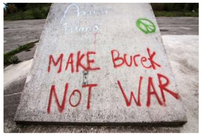
Note: "Burek" is a typical Bosnian food. It would be as if we said "Make pizza, not war." (http://www.thebohemianblog.com/2016/08/ after-the-siege-war-tourism-sarajevo-bosnia.html)

To think about: What is the difference between street art to protest injustice and graffiti that makes a neighborhood ugly?