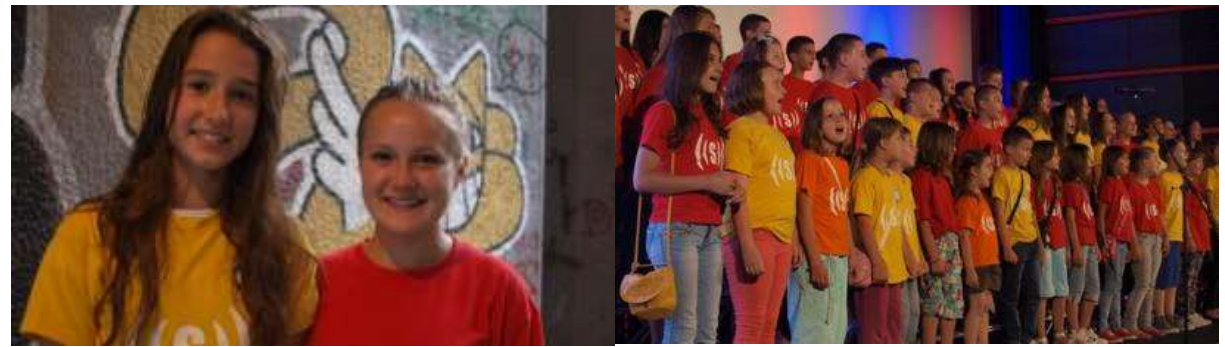
Srebrenica children's choir – 19 years after the killings

To think about: How does music help people in bad times and in good ones?