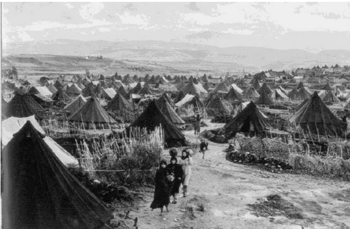
Palestinian Refugee Camp, 1949