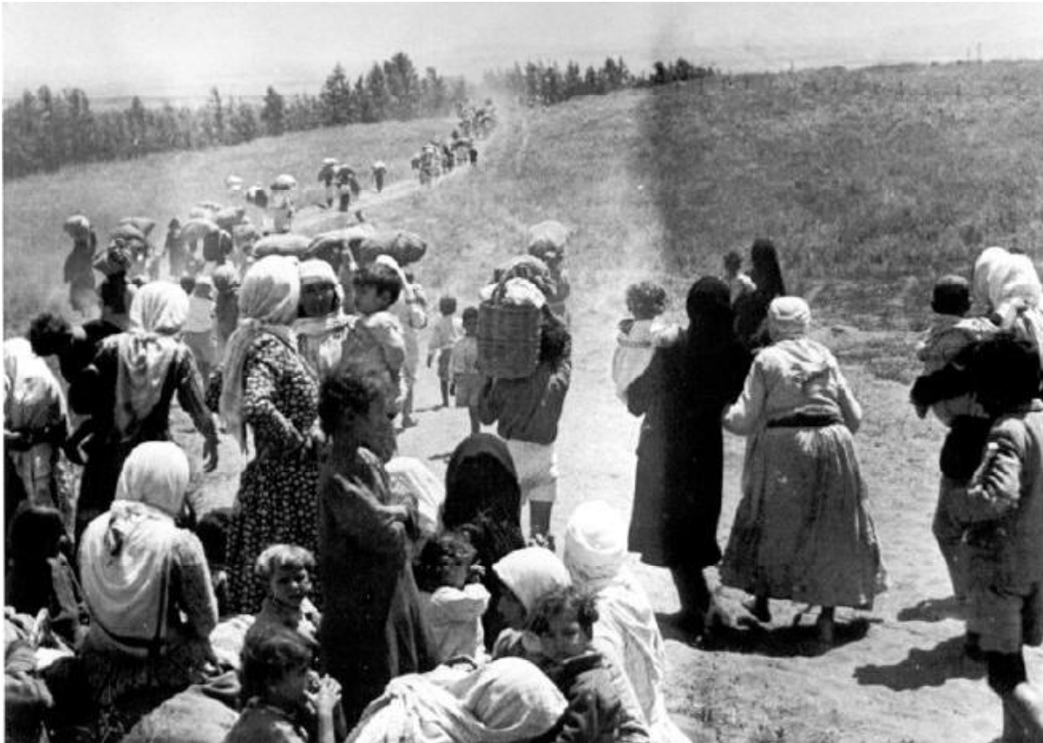
Palestinian Refugee Displacement from Ramle in 1948