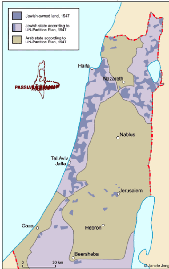
Landownership in Palestine and the UN Partition Plan, 1947