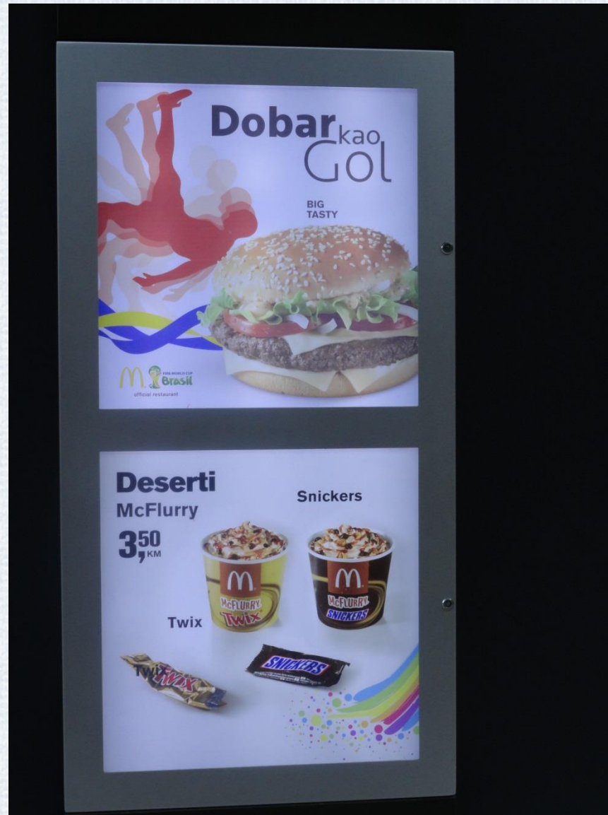
McDonald's menu in Sarajevo, Bosnia-Herzegovina.