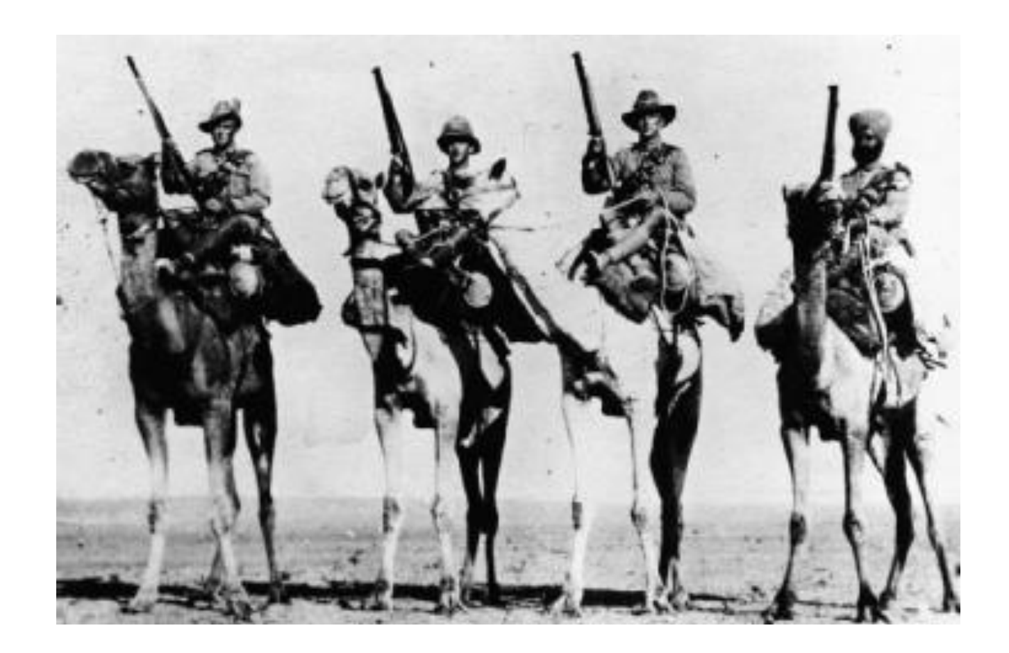
Image 1. British guerrilla operations in Egypt and Palestine in 1918: The Camel Corps included imperial troops from different places. From left to right: Australian, British, New Zealand, and Indian.