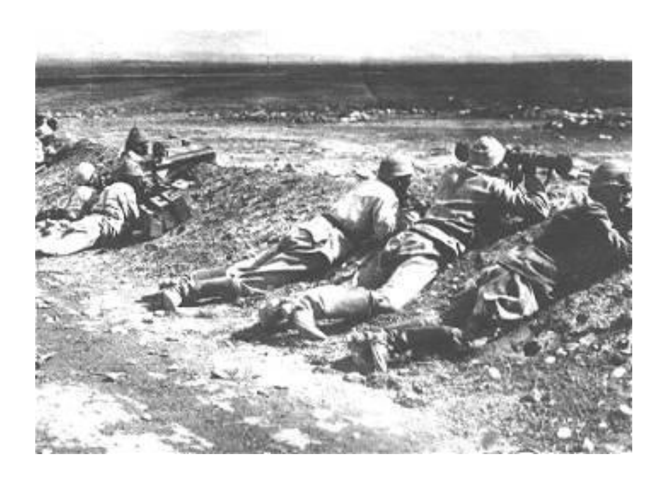
Image 9. Turkish soldiers in a defensive position, with machine guns and a range finder.