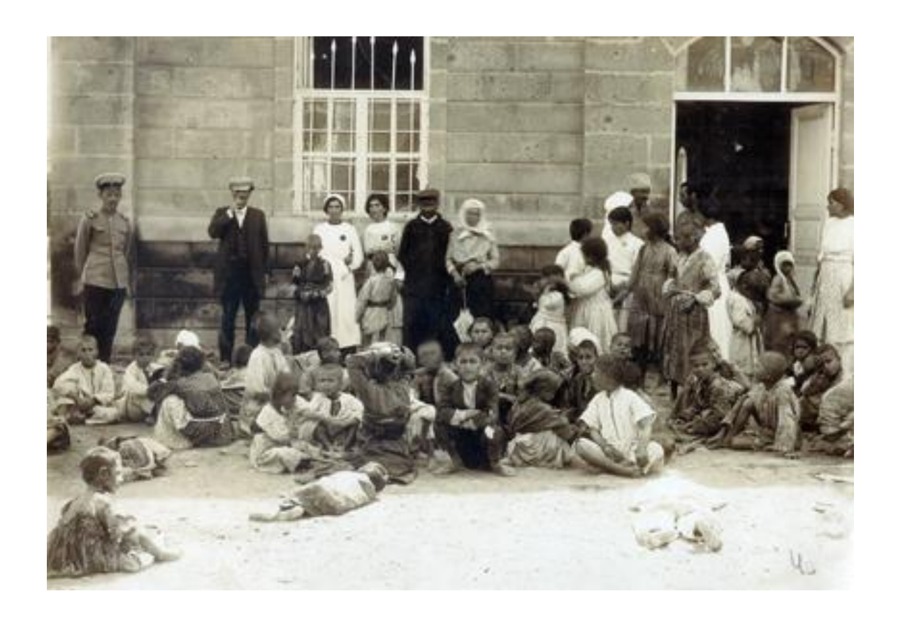
Image 15. Armenian genocide. The orphanage of "Brother Help" in Echmiadzin in 1915.

"The Armenian Genocide and the International Red Cross." The Armenian Genocide Museum-Institute .