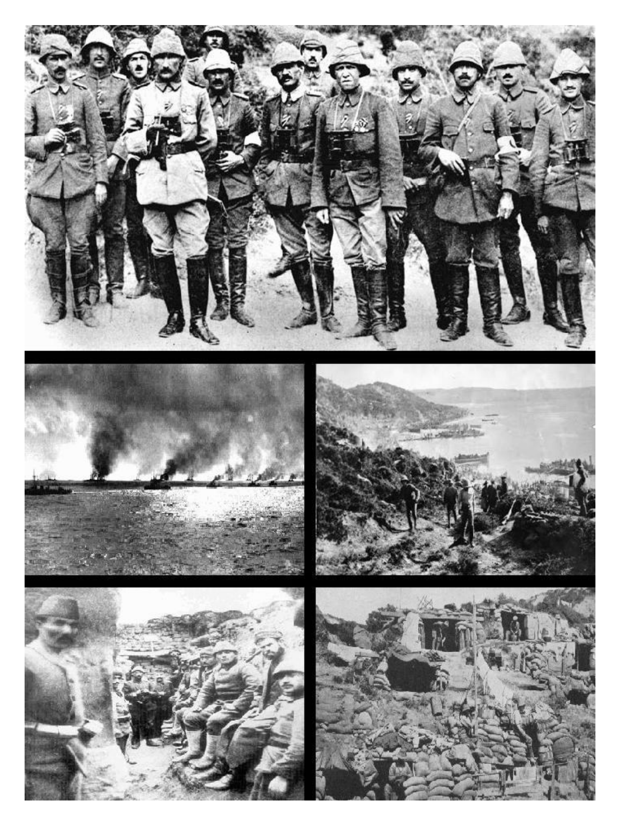
"Gallipoli Campaign." Wikipedia.