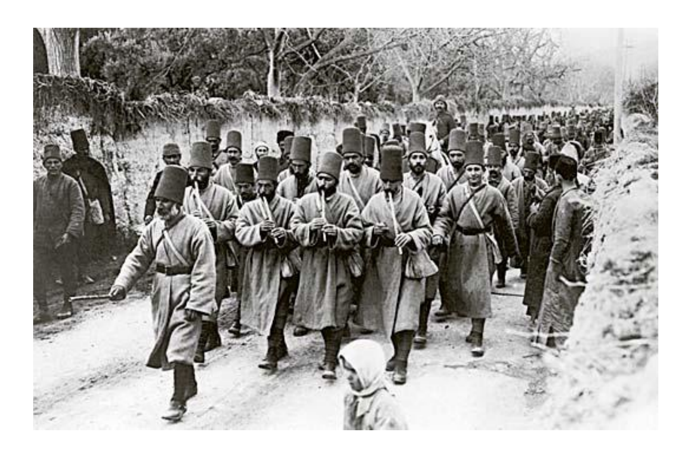
Image 14. Sufi soldiers. A band (literally) of soldiers from the Ottoman Empire march through a town during Great War/ World War I playing music and brandishing their greatest weapon, the characteristic headgear of their religious order.

"Sufi soldiers." Mavi Boncuk: Cornucopia of Ottomania and Turcomania.