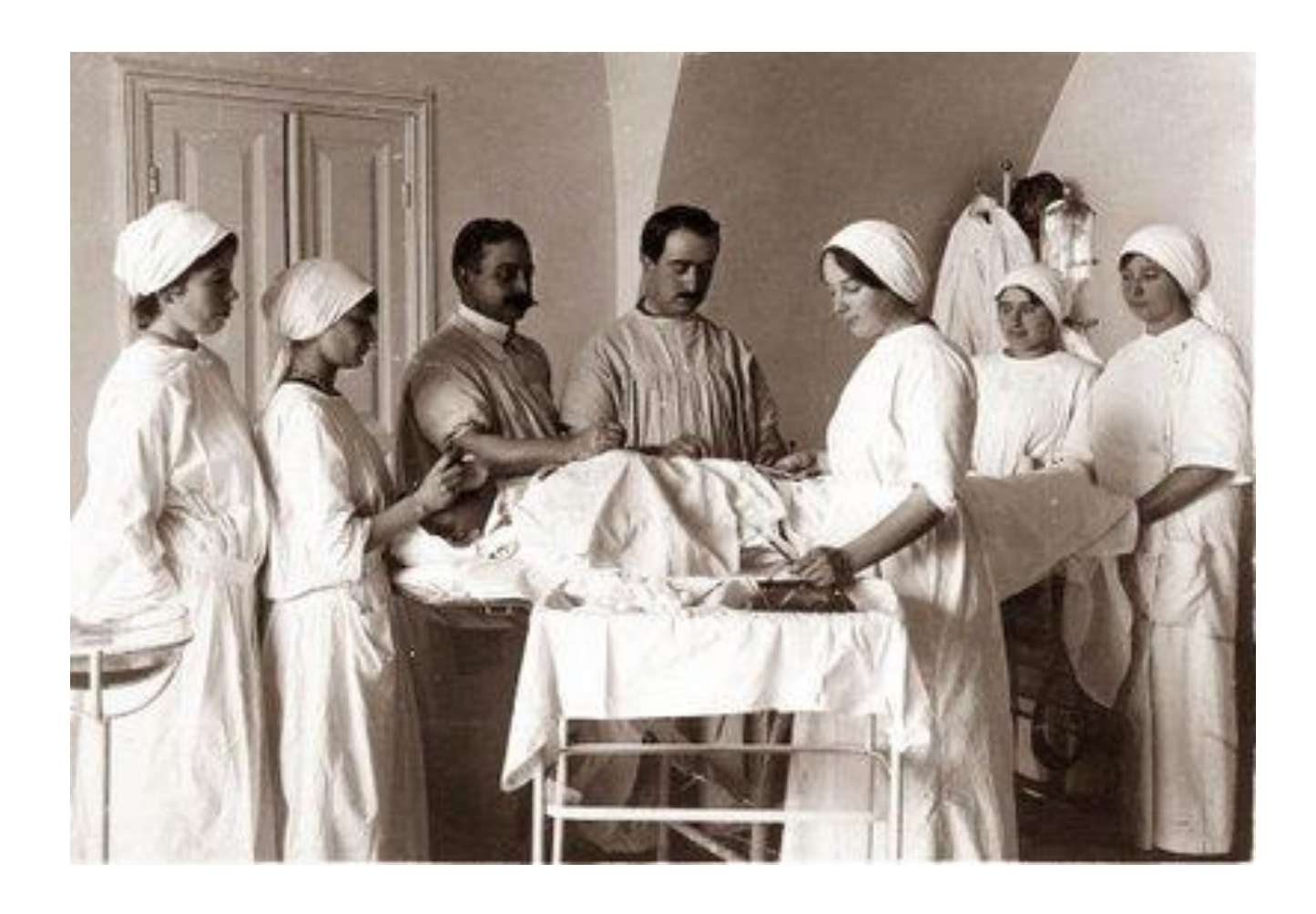
Image 3. A World War I field hospital in the Middle East in 1917. The staff are members of the Red Crescent Society.

http://old-photos.blogspot.com/2008/07/world-war-i-field-hospital.html