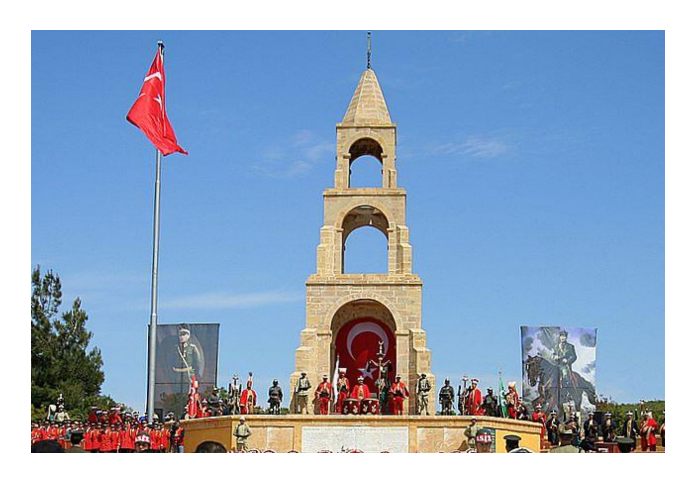
Image 16. Battle of Gallipoli – Turkish memorial. Turkish 57<sup>th</sup> Regiment Memorial Service in 2007 at the Gallipoli memorial.

"Gallipoli, 57th Regiment Memorial - Anzac Day 2007, Turkish 57th Regiment Memorial Service." E-Turkey.net .