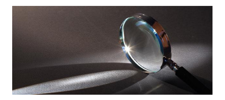
Evidence Card for Investigator #3 – spice plantations