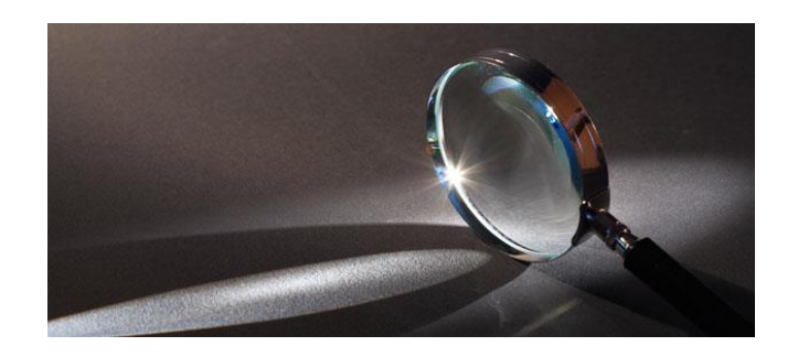
Evidence Card for Investigator #4 – falaj irrigation