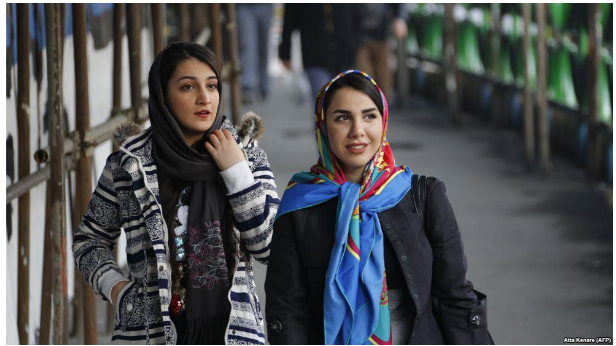
From the article "Iranian Woman Gets Two Years in Prison for Removing Head Scarf." Radio Free Europe, Radio Liberty. 7 March 2018. Web. 23 Oct. 2018.