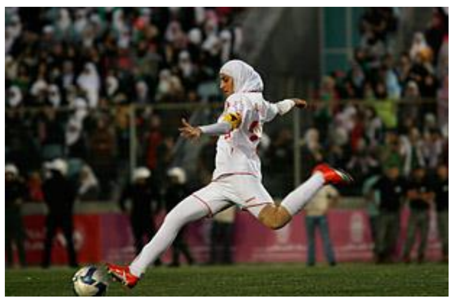
A Warrick Page/Getty Image from: Skarda, Erin. "Iran's Women's Soccer Team's Modest Uniforms." Time. 1 Sept. 2011. Web. 28 Oct. 2018.