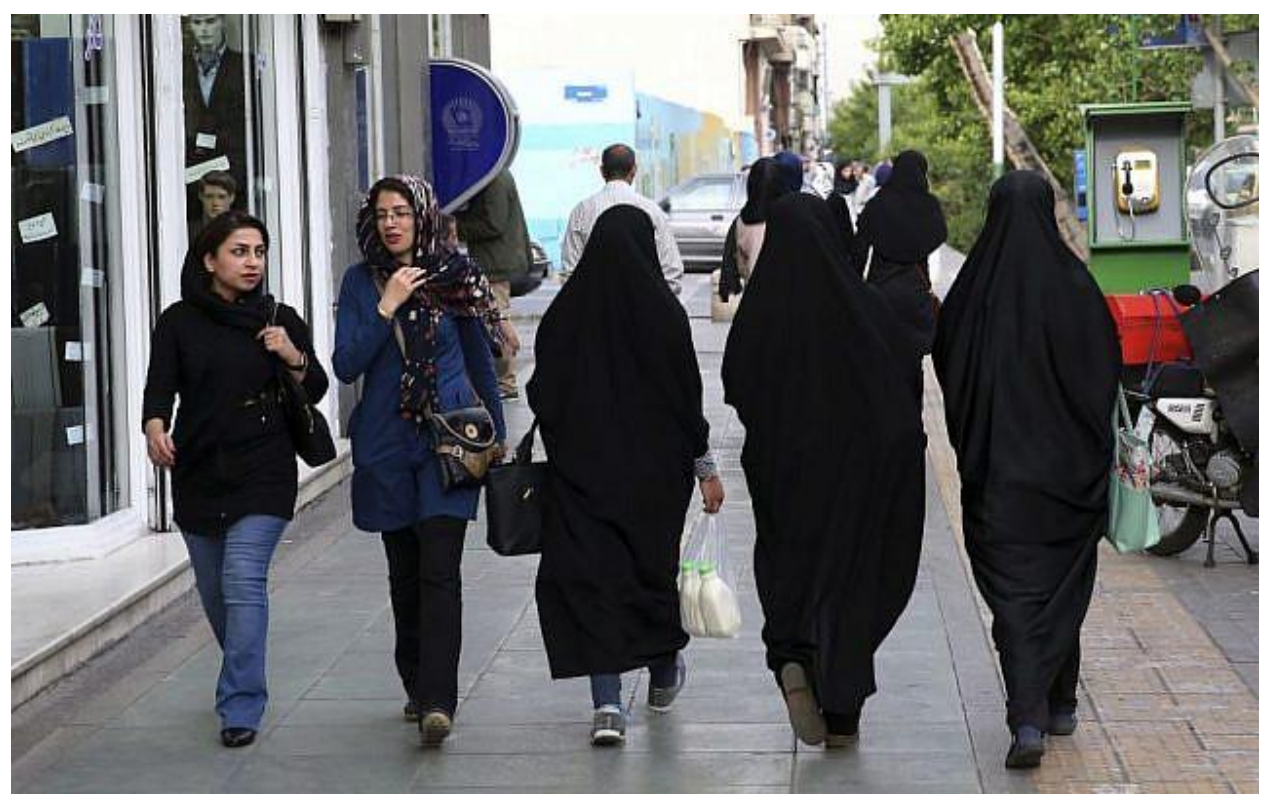
Tehran, Iran, Tuesday, April 26, 2016. frin