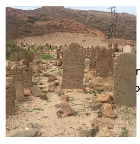
ncouraged to dig a grave ocks on top of body