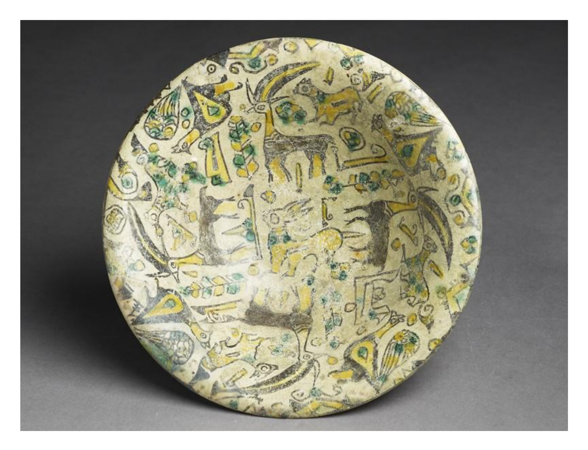
10th c. Iran, Bowl with figurative and plant elements