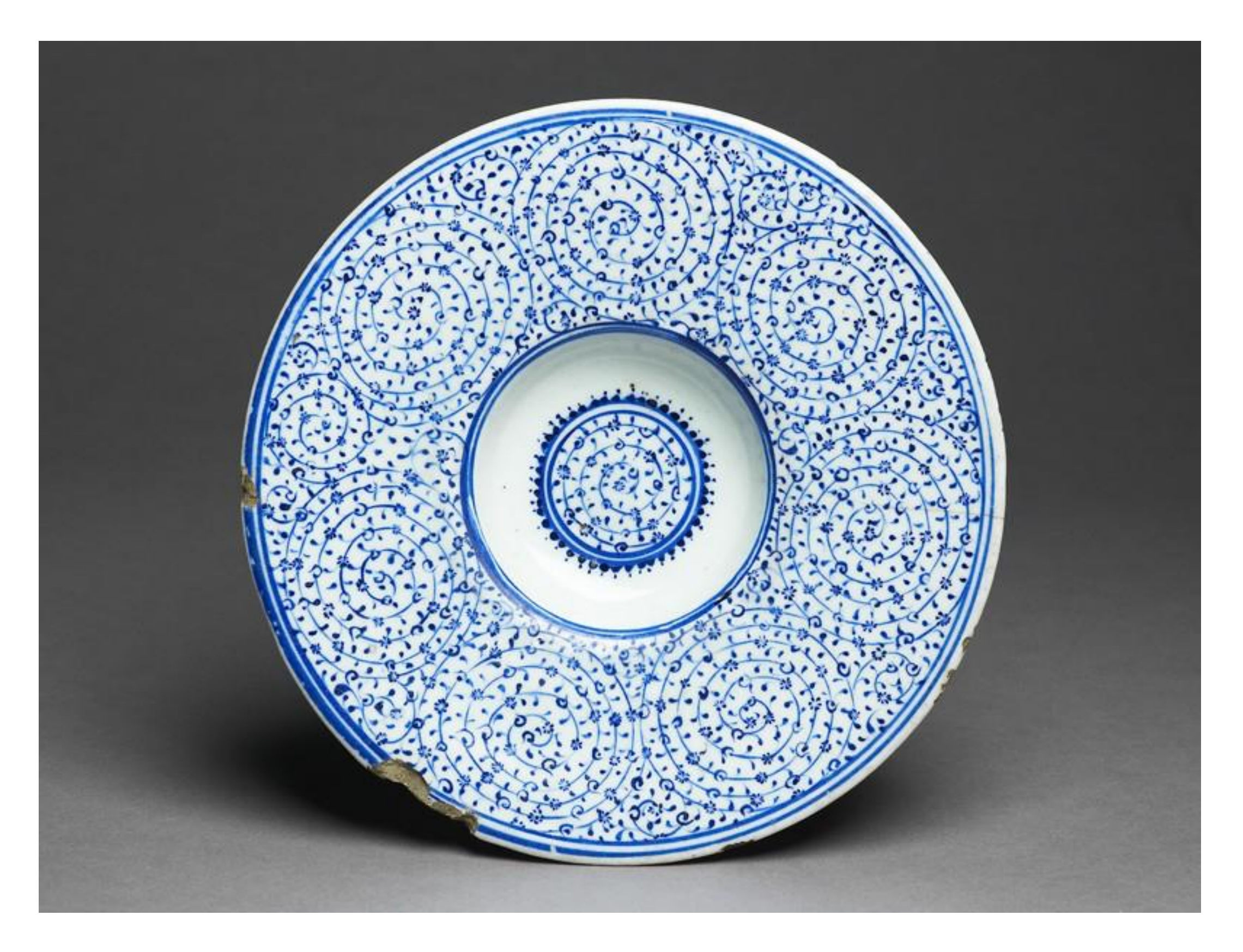
Late 15th c. Iznik pottery, Ottoman Turkey