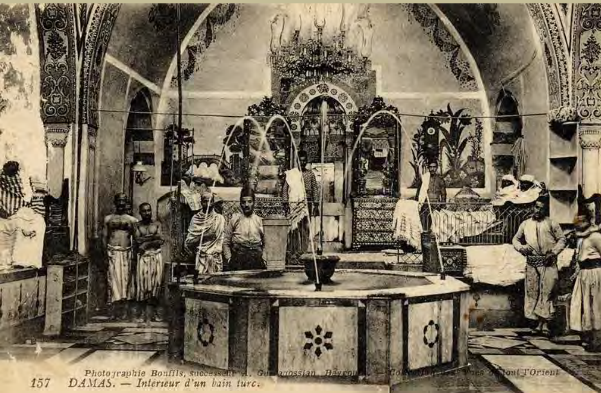
157 Photographie Bonfils, successeur A. Galadossian, Beyrouth. — Collection des Vues de tout l'Orient DAMAS. — Interieur d'un bain turc.