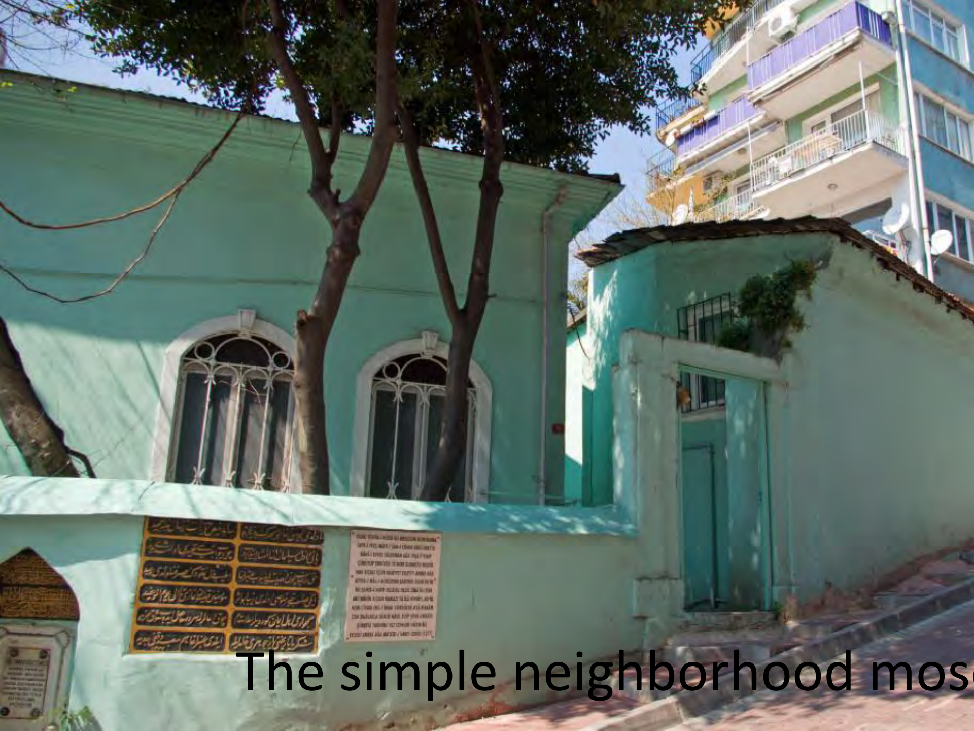
The simple neighborhood mos