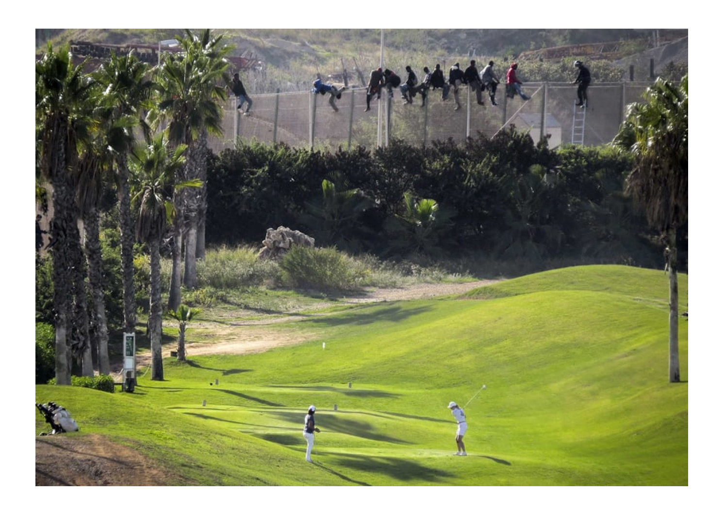
7. The article mentions that the gap in GDP between Spain and Morocco is large. Define GDP, use <u>THIS LINK</u> to the CIA World Factbook to find the GDP of Spain and Morocco and explain how the GDP gap relates to the concept of push and pull factors: